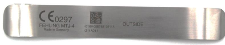
LENGTH / LÄNGE 100 mm